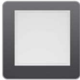
300mm to 600mm LED Lights