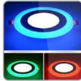
MULTI COLOUR LED CENTRAL LIGHTS