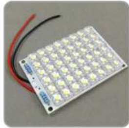
LED LIGHT CIRCUIT BOARD